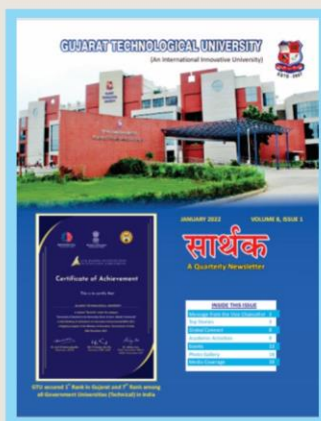
VOLUME 8 ISSUE 1

GTU publishes Quarterly Newsletter "SARTHAK" since last 5 years. In the year 2022, 4 issues of the newsletter were published which are available on GTU website.