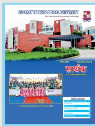
VOLUME 8 ISSUE 2