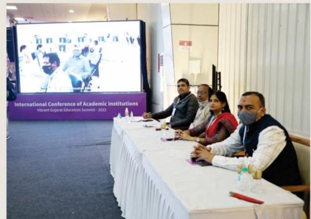
GTU Rapporteurs during ICAI -2022