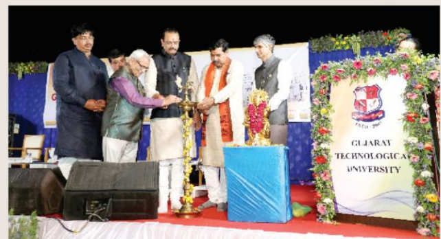
Lamp Lighting Ceremony on the occasion of 15 th Foundation Day Celebration of GTU