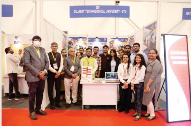
Visitors at GTU Stall

Participation of GTU in the International Conference of Academic Institutions during 10 th Vibrant Gujarat Education Summit - 2022 on 5 th & 6 th January 2022