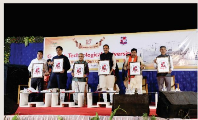
Launching of GTU Logo