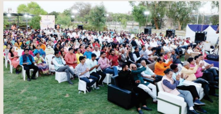
Audience Enjoying the Event