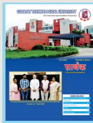
VOLUME 8 ISSUE 3