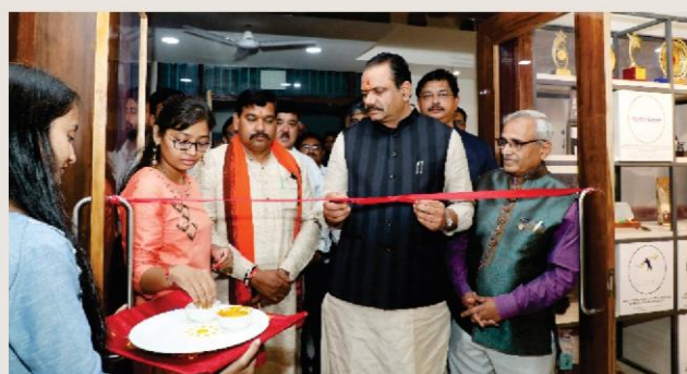
Inauguration of GTU Exhibition Gallery