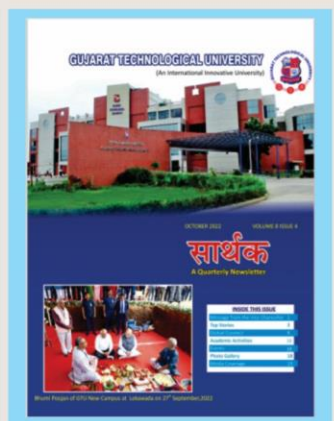
VOLUME 8 ISSUE 4